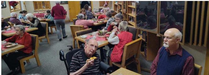
Thank you also to all those who helped make the Sunset Homecoming so much fun. Your help was greatly appreciated.