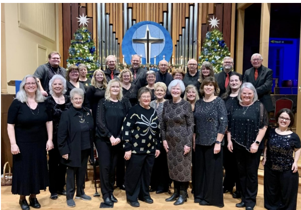
Thank You to all who participated in Carols and Candles, your hard work and dedication shone as bright as the candles! This includes all who were visible and those behind the scenes. We were also glad to see that more people attended in person as well.